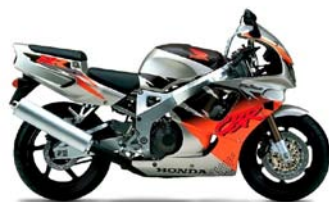
Example of a pure 'on road' design bike

If your bike falls into the category where it has some on road features but is predominately an off-road bike, the Administrator may grant Import Approval if you agree to the following: