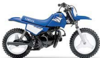
Example of an 'off road' bike

Generally if a bike was designed principally for 'on road use' and has lights, blinkers, side mirrors and provision for a number plate, it is regarded as an ON ROAD bike. However there are cases where some bikes are manufactured with the above features but are still regarded as an off road design. Below are examples of off/on road bikes: