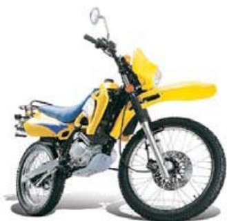
Example of a bike that has 'on road' features but could be also classed as 'off road' bike.