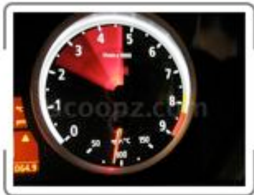
UK & rest of the world.

The revs for launch control default to 4000rpm, if you want to higher or lower the launch rpm (wet tarmac, experiments, etc) you can press forwards or backwards on the cruise control level and the rpm will rise or fall by a few hundred each time.